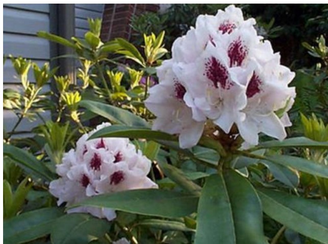
White Blue Peter