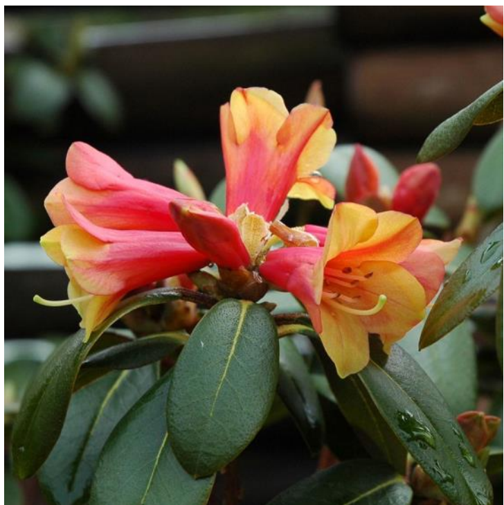
What a Dane